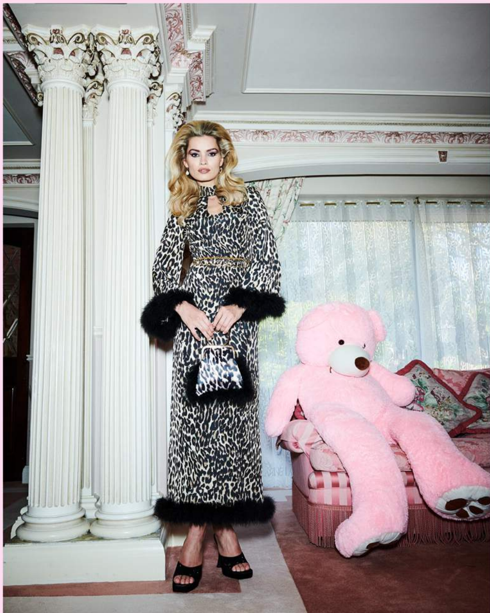
LEOPARD PRINT CREPE MAXI DRESS EMBELLISHED WITH BLACK MARABOU GOLD HEART CHARM BELT PEARLY MISMATCHED EARRINGS LEOPARD PRINT SATIN MINI WRISTLET BAG TRIMMED IN BLACK MARABOU BLACK CRYSTAL EMBELLISHED MULES BY JEFFREY CAMPBELL