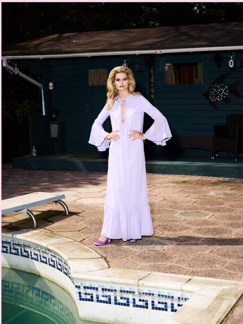
LILAC METALLIC GEORGETTE RUFFLE MAXI DRESS MISMATCHED PEARLY EARRINGS LILAC SATIN MARYJANES WITH PEARL HEART BUCKLES