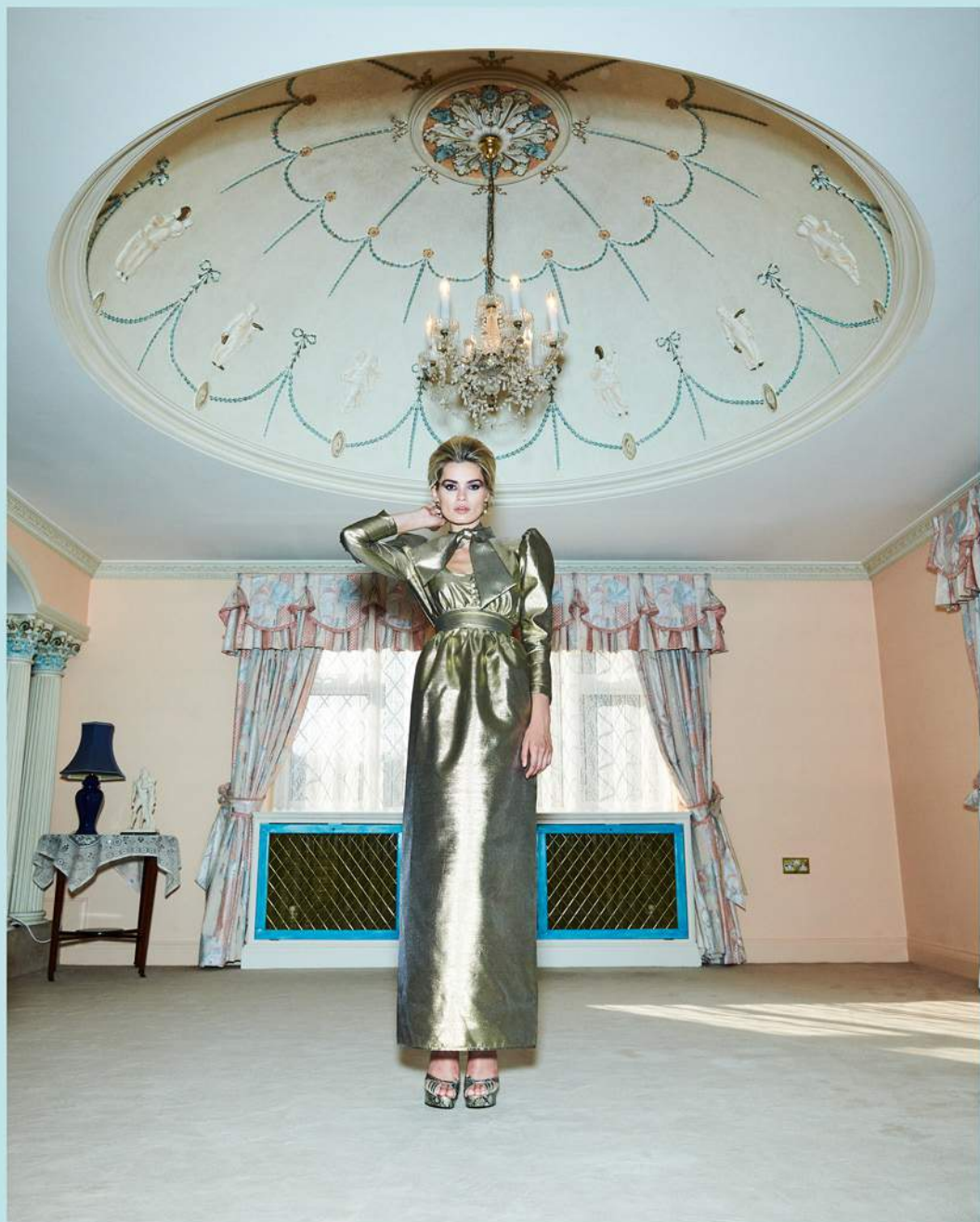
GOLD METALLIC JACQUARD UPSIDE DOWN HEART CUT OUT MAXI DRESS N & A X DESERT MINE JEWELRY 14K GOLD PLATED BRASS PANTHER PEARL DROPLET EARRINGS LEATHER SNAKESKIN EMBOSSED METALLIC WEDGE PLATFORMS BY TERRY DE HAVILLAND