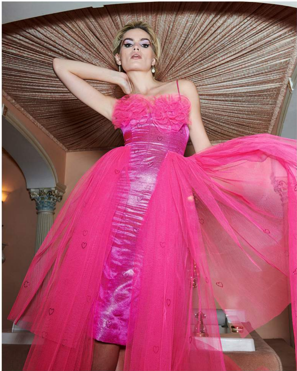
FUCHSIA METALLIC JACQUARD MIDI DRESS WITH INTERNAL CORSET, TULLE OVERLAYS, RUFFLE HEART EMBELLISHMENTS MISMATCHED PEARLY EARRINGS FUCHSIA CRYSTAL EMBELLISHED SLINGBACKS BY JEFFREY CAMPBELL